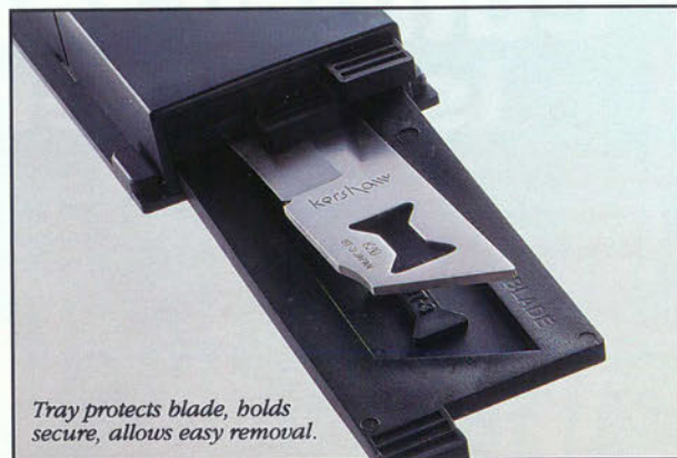
Tray protects blade, holds secure, allows easy removal.