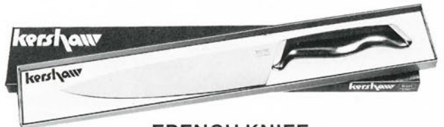
FRENCH KNIFE Model 3020 $14.50