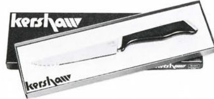
UTILITY/STEAK KNIFE Model 3005 $6.50