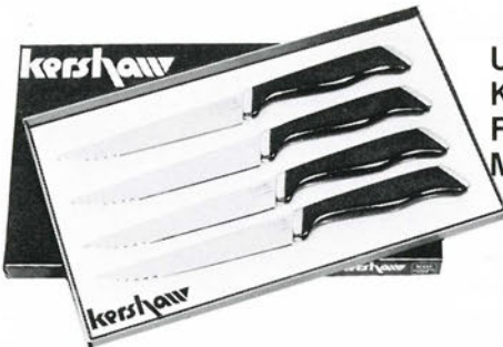
UTILITY/STEAK KNIFE Foursome Model 3405 $24.50