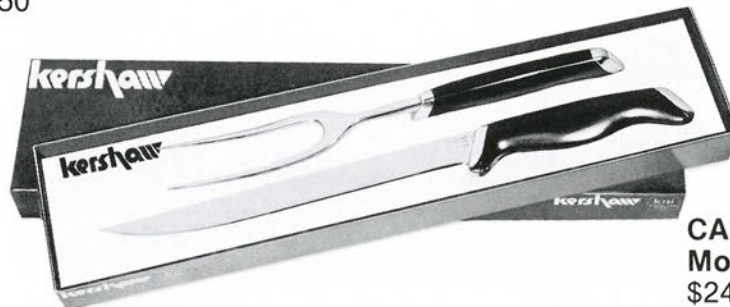
CARVING SET Model 3226 $24.50