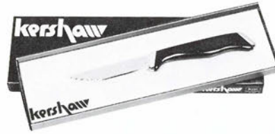
PARING KNIFE Model 3000 $4.50