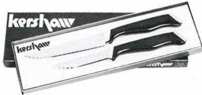
PARING KNIFE and UTILITY/STEAK KNIFE Duo Model 3201 $10.50