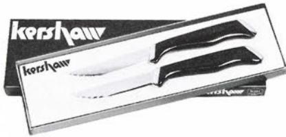
PARING KNIFE Twins Model 3200 $9.00