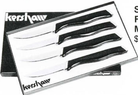
STEAK KNIFE Foursome Model 3410 $19.50