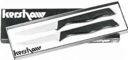
STEAK KNIFE Twins Model 3210 $10.00