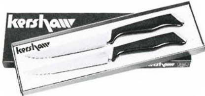
UTILITY/STEAK KNIFE Twins Model 3205 $12.50