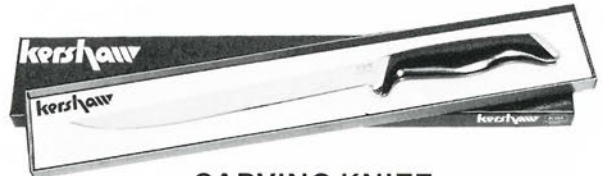
CARVING KNIFE Model 3025 $10.50