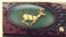
11CP "Running Deer"