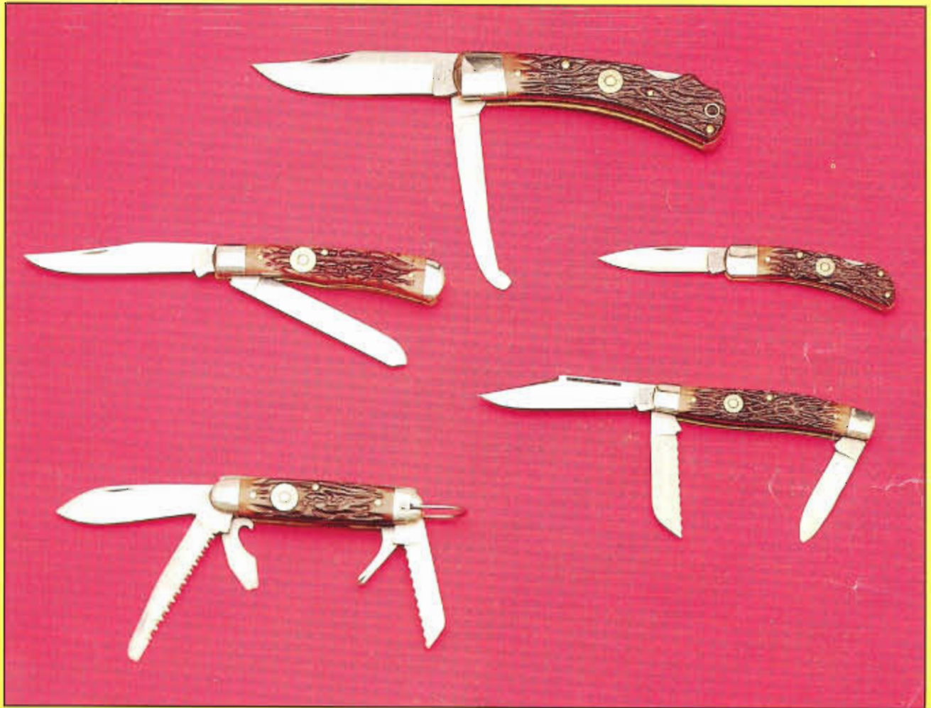
Cartridge Series. Page 2

AMERICA'S OLDEST, CONTINUOUS KNIFE MANUFACTURER