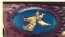
11BP "Howling Coyote"