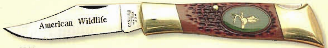
11AP "Buck Deer"