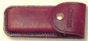
104 Brown leather sheath (6" length)