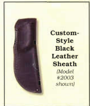
Custom-Style Black Leather Sheath (Model #2003 shown)