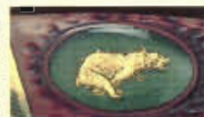
11DP "Charging Bear"