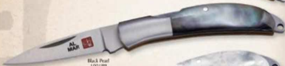
Black Pearl 1001BP