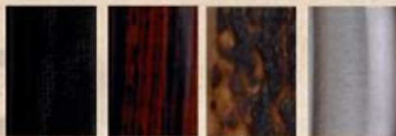
Black Lichen Micarta 1001BM

All Osprey™ Classics come with a leather pouch.