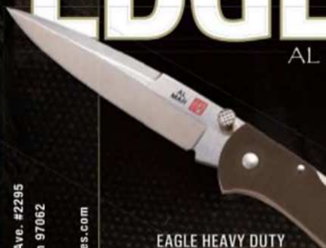
EAGLE HEAVY DUTY ZDP-189