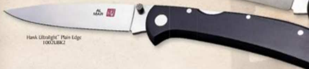
Hawk Ultralight™ Plain Edge 1002UBK2