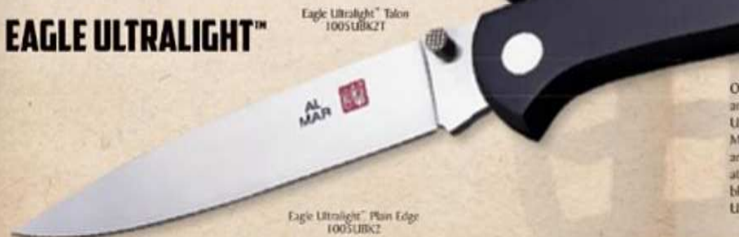
Eagle Ultralight™ Talon 1005UBK2T