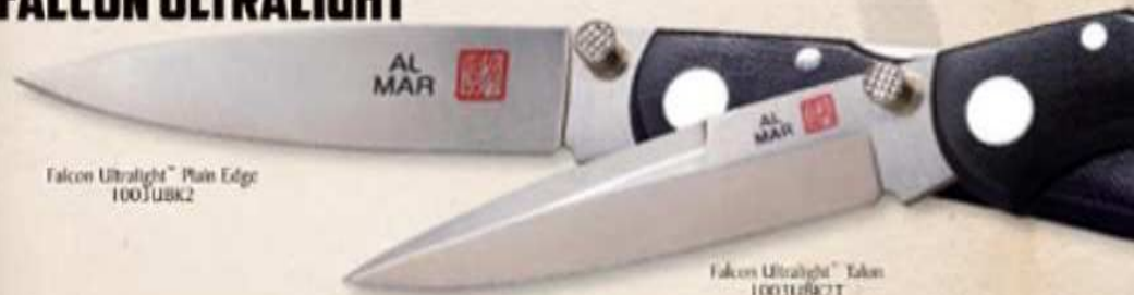
Falcon Ultralight™ Plain Edge 1003UBK2