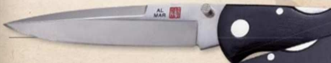
Falcon Ultralight™ Talon 1003UBK2T