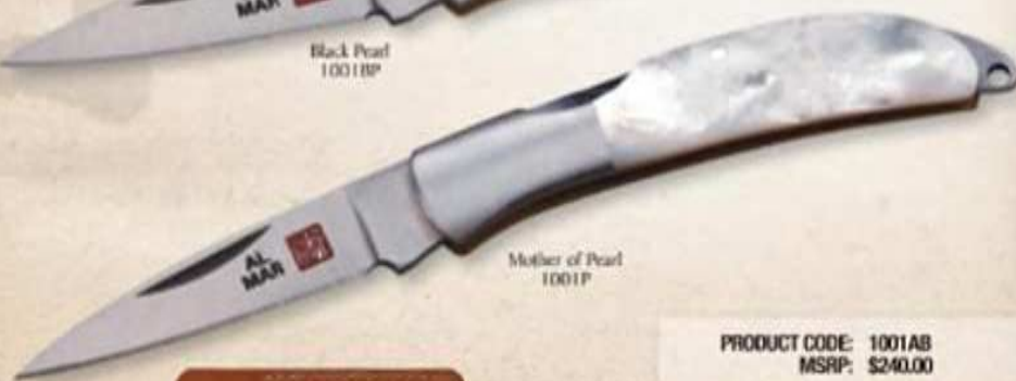
Mother of Pearl 1001P