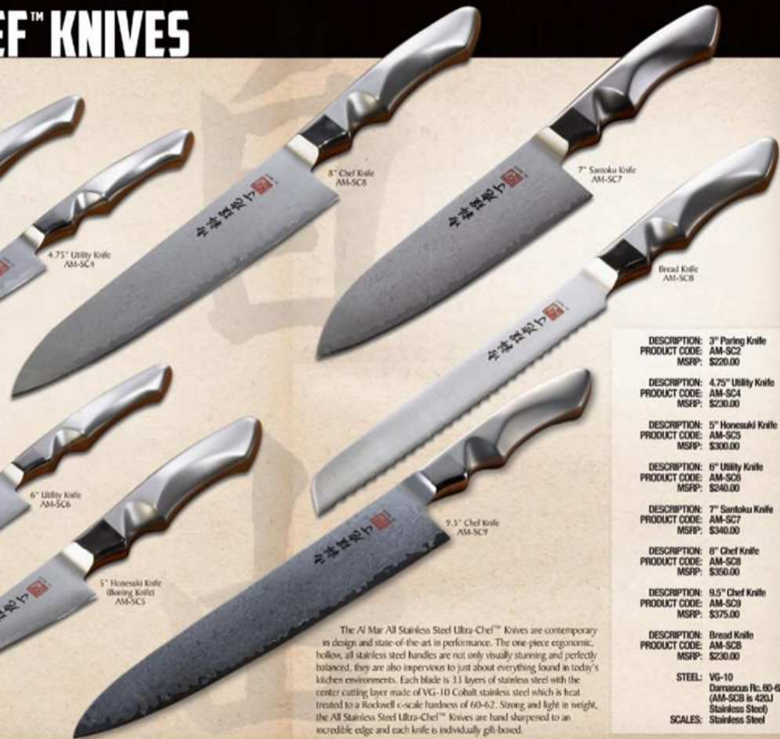
4.75" Utility Knife AM-SC1