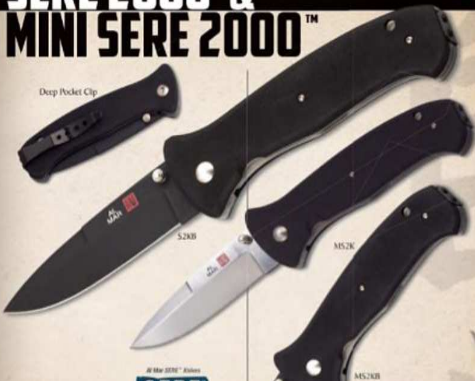
Deep Pocket Clip