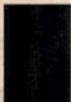
Black Linen Micarta 1001BM

All Osprey™ Classics come with a leather pouch.