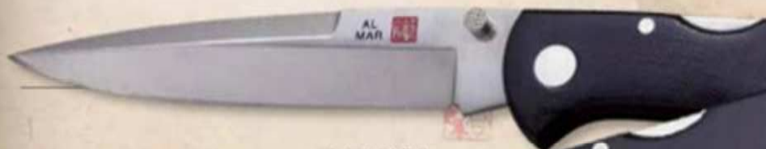
Eagle Ultralight™ Takedown 1005UBK2T