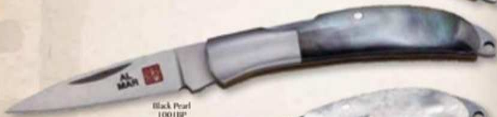
Black Pearl 1001BP