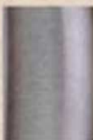
Stainless Steel 1001SS

The diminutive Osprey™, an Al Mar Classic since 1979, offers timeless design and peerless craftsmanship usually found only on the finest custom hand made knives; all in the smallest, highest quality, front lock made today. The Osprey™ features stainless steel bolsters, brass liners and comes with a finely crafted leather pouch embossed with the Al Mar logo.