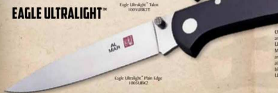
Eagle Ultralight™ Plain Edge 1005UBK2