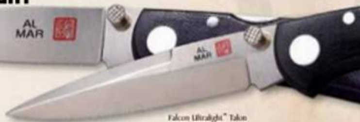
Falcon Ultralight™ Takedown 1003UBK2T