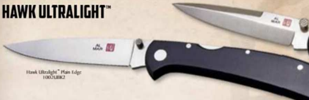
Hawk Ultralight™ Plain Edge 1002UBK2