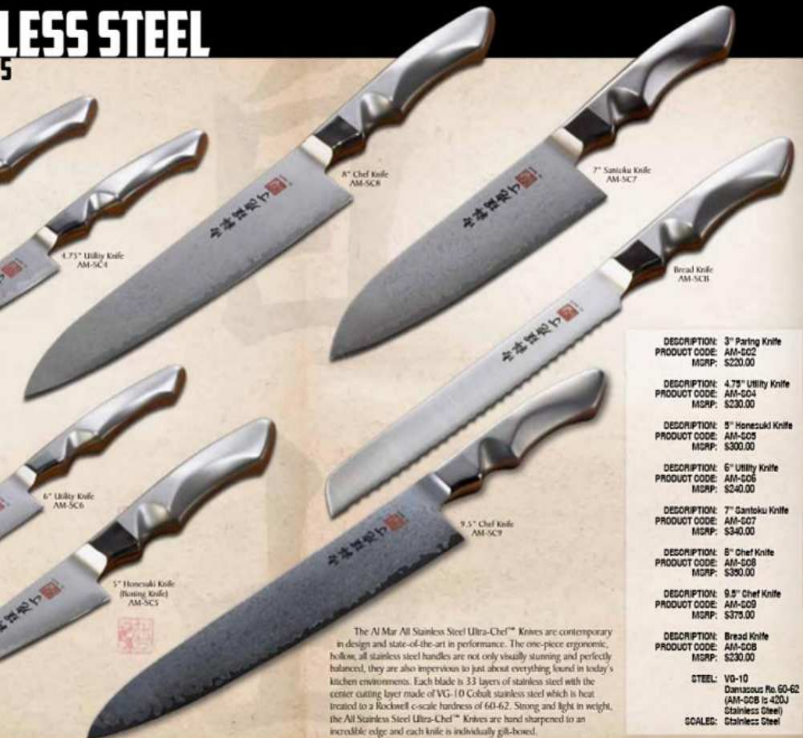
4.75" Utility Knife AM-SC4