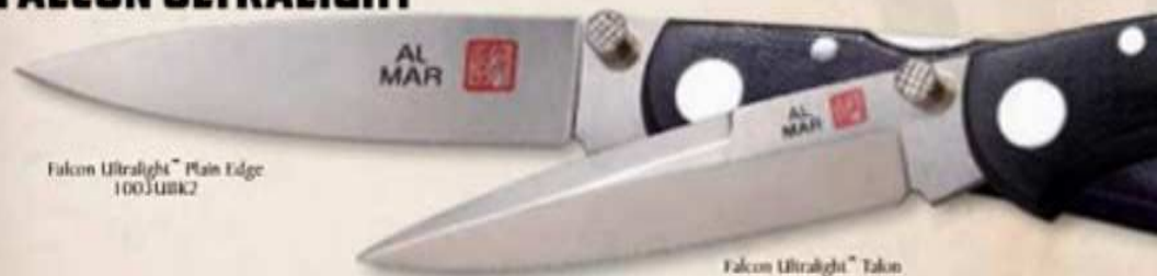
Falcon Ultralight™ Plain Edge 1003UBK2