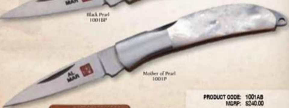
Mother of Pearl 1001P