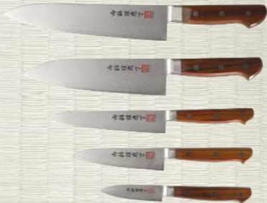
Ultra-Chef blade showing - the detailed pattern in the multiple layers of steel.

The "Ultra Chef" models - classic in design - state of the art in Performance. Each blade is 33 individual layers of stainless steel - 16 layers per side plus the center layer of VG-10 Cobalt stainless steel and hardened to a Rockwell of 60-62. These knives are incredibly strong, light in the hand, perfectly balanced and extremely sharp. We didn't stop there - the handles are made from select Cocobolo, long considered one of the world's most beautiful exotic hardwoods. The Ultra-Chef™ Line - arguably, the finest chef's knives made today. Each knife is individually gift boxed.