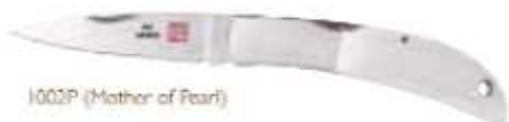
1002P (Mother of Pearl)