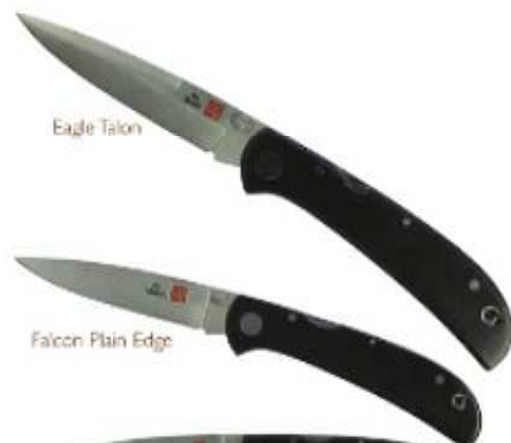
Falcon Plain Edge